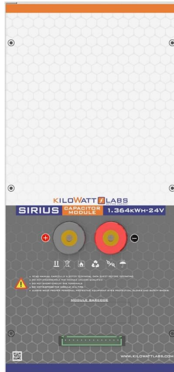
2. Capacity Extension Module